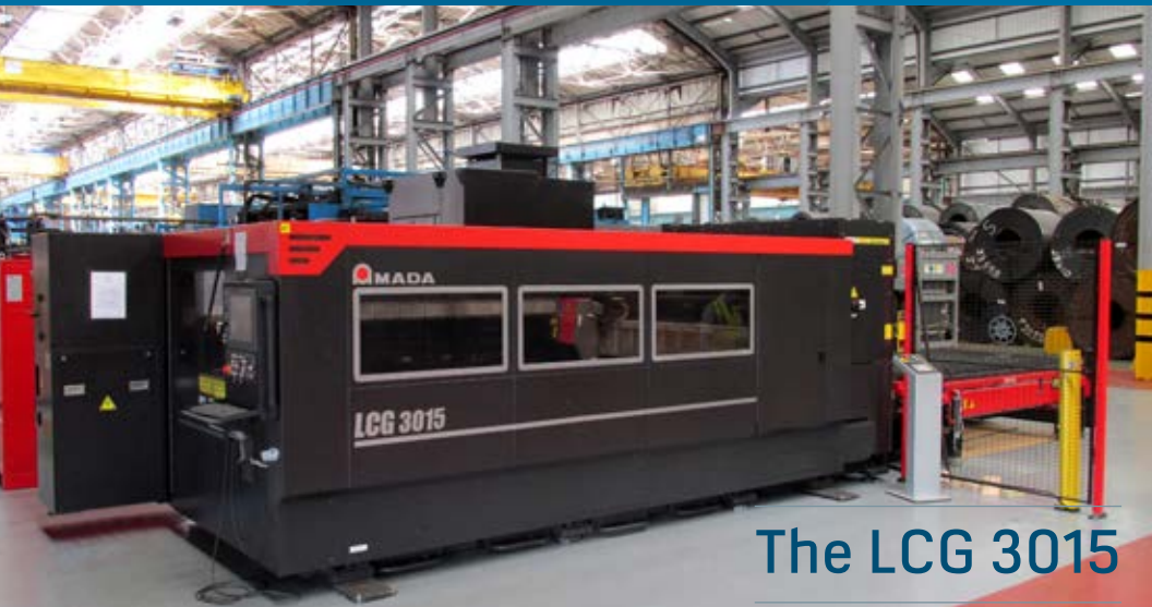
The LCG 3015

Meet our new Global Standard CO 2 laser cutting machine